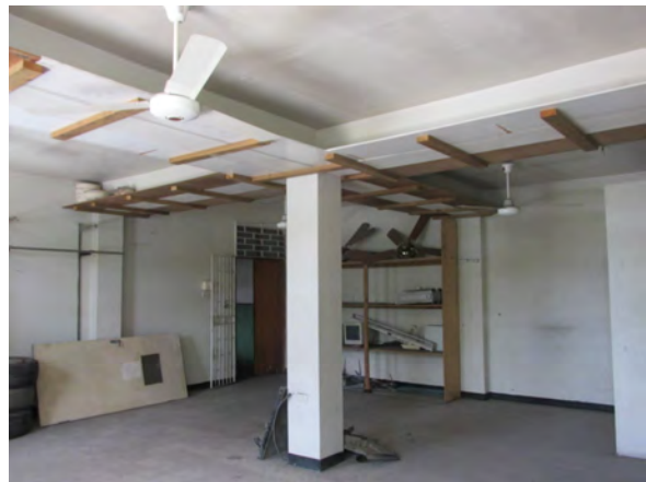
First Floor Rear