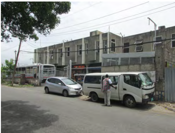
South Side View