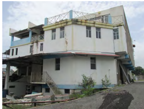
Rear (of Front Building)