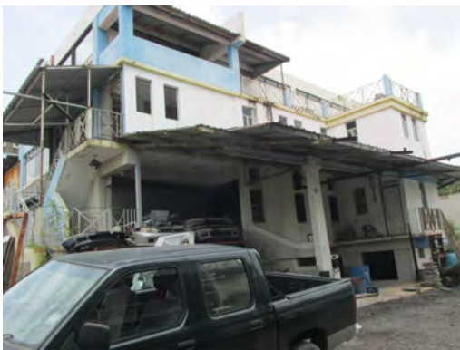
Rear (of Front Building)